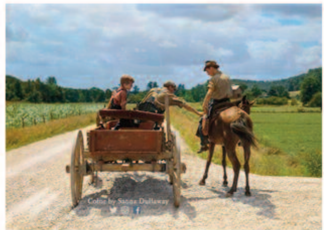
Rural mailman transfers letters and packages to another postman's saddlebags — he will ride further up the side road and creek beds where no wagon or car can go. In the mountain section near Morehead, Kentucky, 1940.

We also publish an excellent quarterly bulletin, The Pennsylvania Postal History Historian. We are currently offering a discounted membership along with a sample copy of the bulletin. Email a request for the sample and information about membership to skennedy@paphs.org . Our website is located at http://paphs.org .