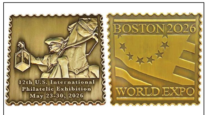
Boston 2026 Medal for Exhibitors

If you do attend Boston 2026 World Expo, make it memorable and tell us all about your experiences! At one of our next GPSCC meetings, I would like to hear personal feedback from members who attended the show. If you attend the show but cannot get to a GPSCC meeting in the future, then please drop me a note at president@gpsc.org and tell me about your visit. I will share your stories with GPSCC members and possibly create a write-up in a future edition of The Philly Philatelist .