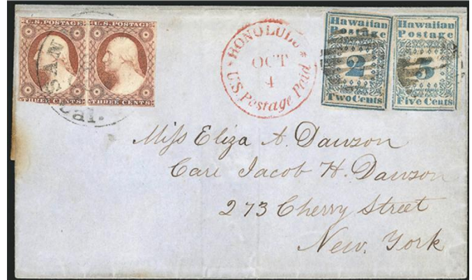
Hawaiian Missionaries stamps, 1851