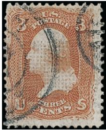
3c George Washington B Grill, 1867

Although many other fantastic examples of famous, rare, and valuable stamps could easily qualify for this imaginary exhibit, three more “honorable mentions” are identified below. Space does not allow for an expanded description, but the caption below are linked to online descriptions.