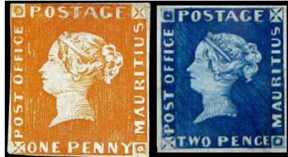
Mauritius "Post Office" stamps, 1847