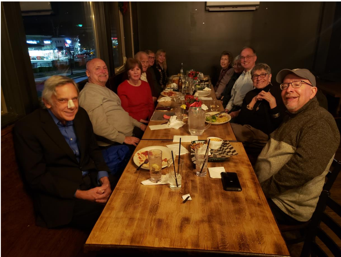
Club members enjoy a holiday dinner at The W Tavern on December 19, 2023.

You can feel good about your contributions to the Club and everyone benefits!