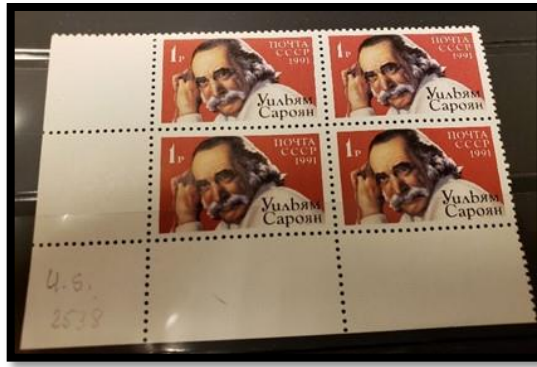
Russia's 1991 stamp commemorating Armenian-American novelist, William Saroyan