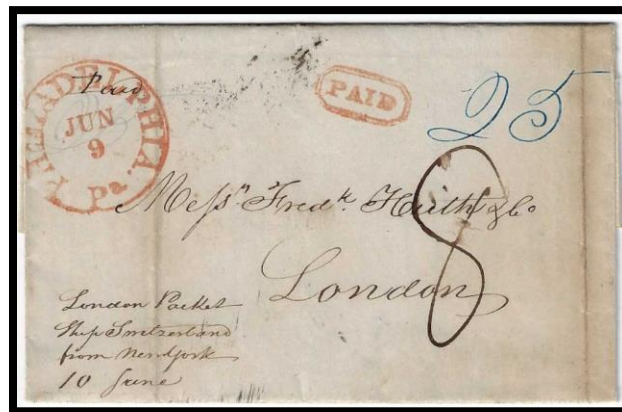
Cover from Philadelphia to London